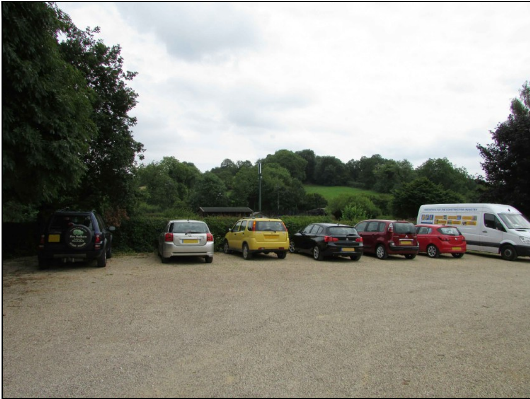
Photomontage - Proposed 12.5m monopole supporting 3No. Antennas and 2No. Dishes. Operator equipment Cabinets installed at ground to the side of monopole (hidden from view).